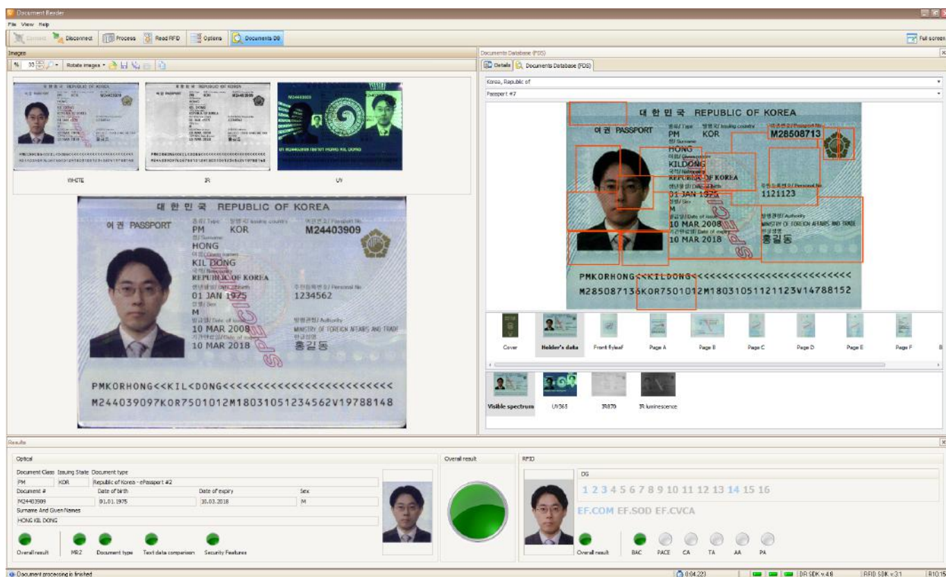
Viewing the passport from IRS database