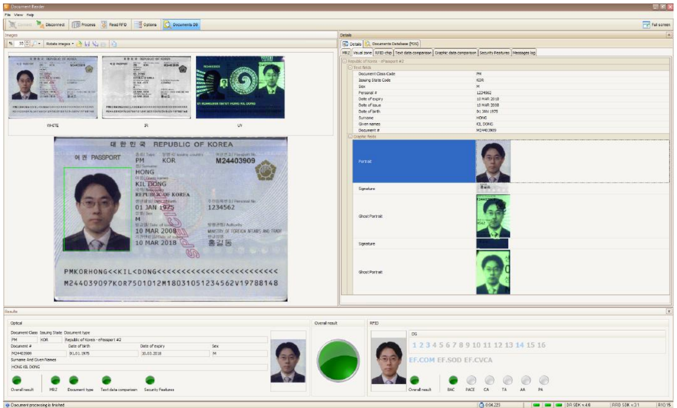
Visual zone of the passport