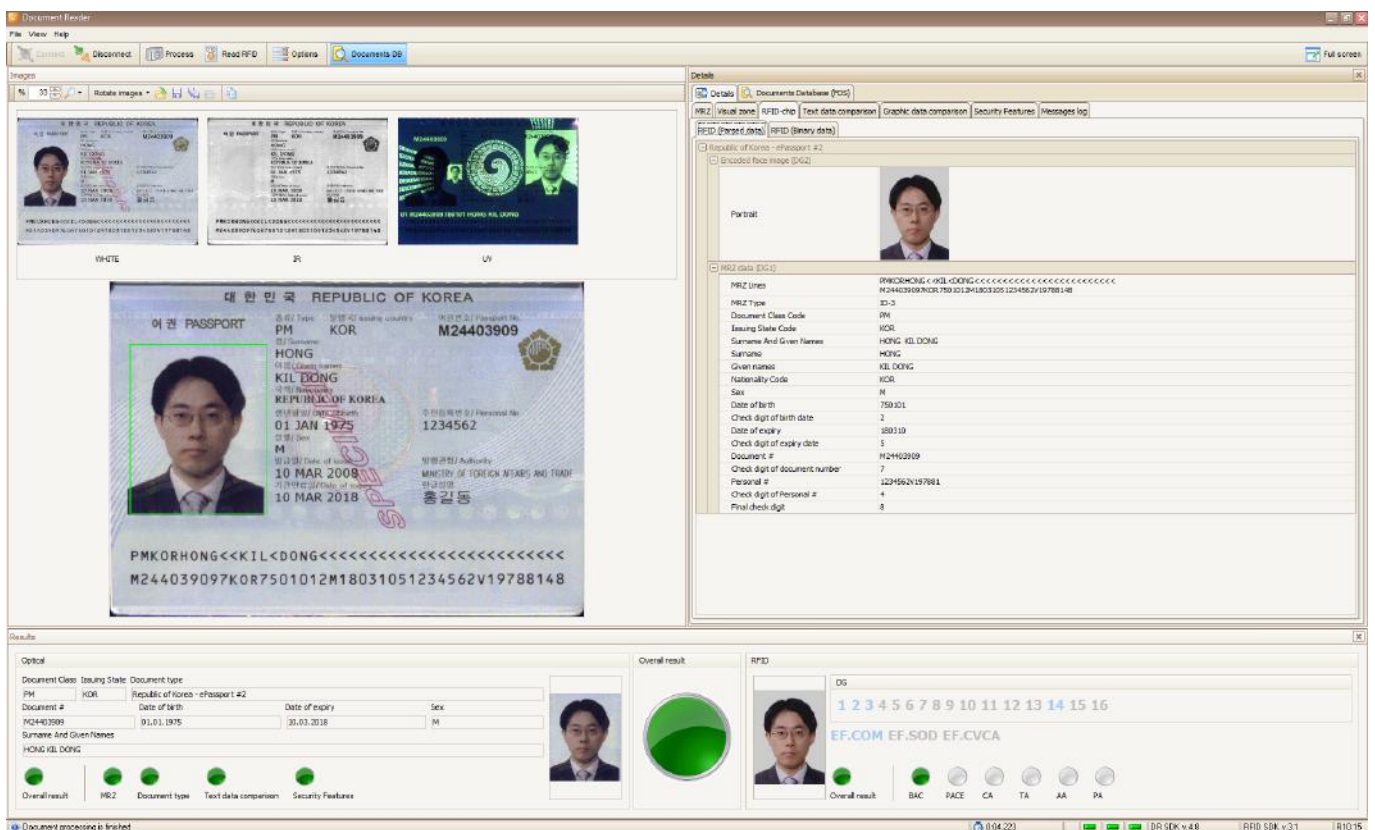
RFID-chip of the passport