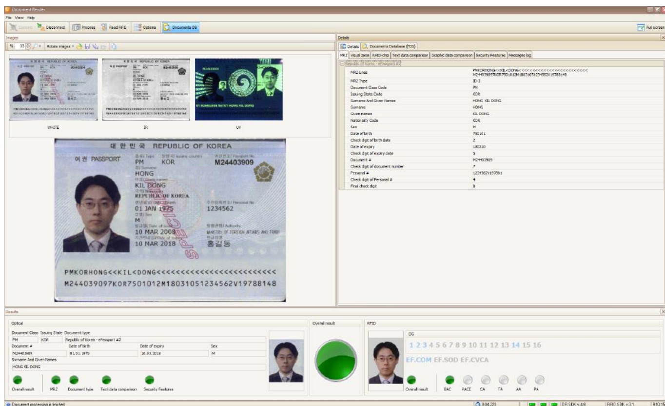
MRZ of the passport